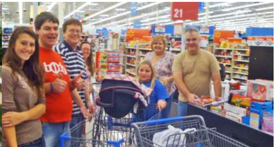
THROUGHOUT 2011, THE CHILDREN OF THE CHURCH COLLECTED POCKET CHANGE AT THE FOUR "FIFTH SUNDAY" SERVICES. THE COLLECTION, CHANGE FOR CHANGE , WAS DESIGNATED TO BUY TOYS FOR MISSION WACO'S BIKER TOY RUN WHICH CENTRAL HAS TRADITIONALLY SUPPORTED. WITH OVER $600 DOLLARS, THE CHILDREN WENT ON A FUN-FILLED AND HEARTWARMING SHOPPING SPREE. THE YOUTH OF THE CHURCH AND PARENT HELPED OUT. THANKS TO EVERYONE FOR DONATING AND HELPING.