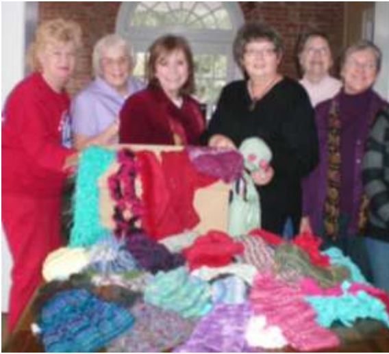
AN ACTIVE FELLOWSHIP AT CENTRAL IS MISSION CRAFTERS WHO MEET TWICE EACH MONTH AT A MEMBER'S HOME. MANY ALSO MEET ONCE A MONTH WITH OTHER CRAFTERS FROM LAKE SHORE BAPTIST CHURCH. THE CRAFTERS ARE SHOWN PRESENTING HANDMADE SCARVES, HATS, GLOVES, AND SHAWLS TO COMPASSION MINISTRIES (LEFT) AND MISSION WACO (RIGHT).