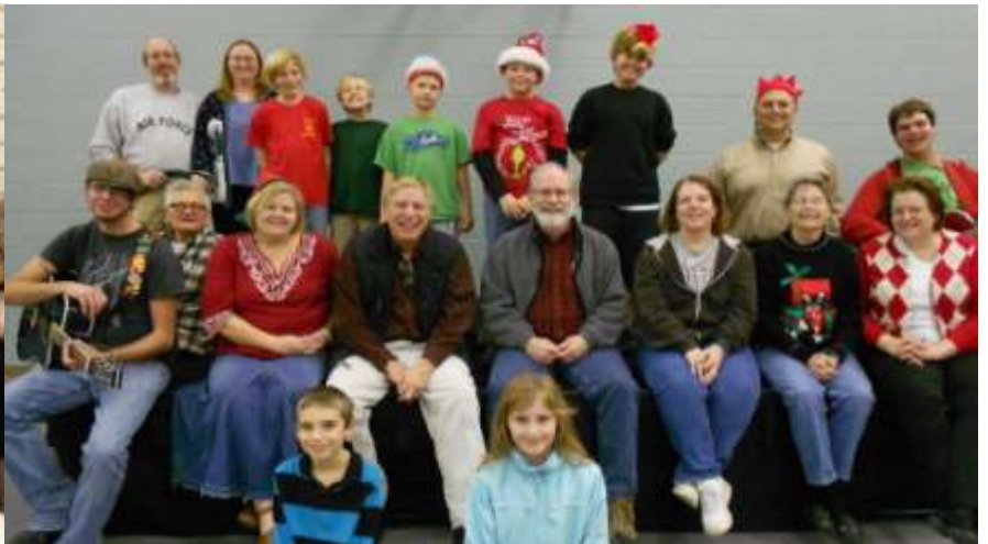
OVER TWENTY MEMBERS AND FRIENDS GATHERED ON DECEMBER 18 TO VISIT MEMBERS WHO ARE HOMEBOUND OR RESIDING IN RETIREMENT AND NURSING HOMES. AFTER THE CAROLING, THE CAROLERS GATHERED FOR CHILI AT THE CHURCH.